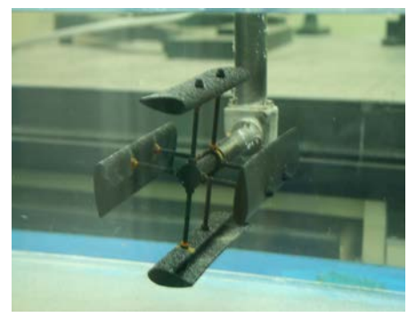
Fig. 1 Picture of used 4-blades mill.

Care should be taken over the preparation of diagrams and figures which may incorporate color where it adds to the presentation. Figures will either be entered in one column or two columns and should be 80 mm or 170 mm wide respectively. A minimum line width of 1 point is required at actual size. Annotations should be in 10 point with the first letter only capitalized. The figure caption should be preceded by 'Fig.' followed by the figure number. For example, 'Fig. 10 The Vortex shedding......'.